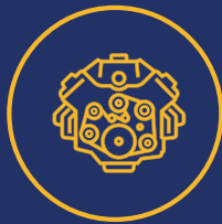
ADVANCED TRANSPORTATION & LOGISTICS