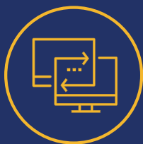
INFORMATION COMMUNICATION TECHNOLOGIES (ICT) & DIGITAL MEDIA