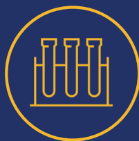
LIFE SCIENCES & BIOTECHNOLOGY