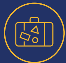
RETAIL, HOSPITALITY & TOURISM

200+ degrees and certification specialties in high demand industry sectors