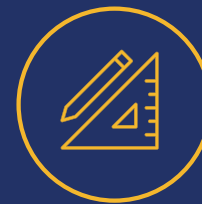
ENERGY, CONSTRUCTION & UTILITIES