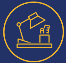
BUSINESS & ENTREPRENEURSHIP