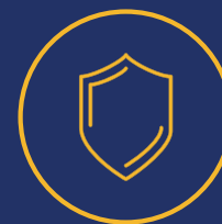
PUBLIC SAFETY & GOVERNMENT