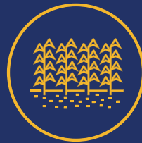
AGRICULTURE, WATER & ENVIRONMENTAL TECHNOLOGIES