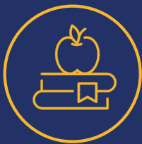
EDUCATION & HUMAN DEVELOPMENT