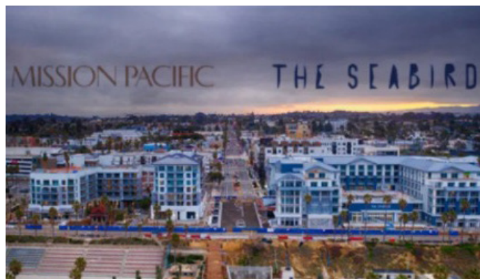
Mission Pacific Hotel and The Seabird Resort Debut in Oceanside

The program's success led to exclusive internship opportunities for North County CTE students and a permanent Junior Task Force program. For more information on upcoming student internship opportunities visit Hyatt .