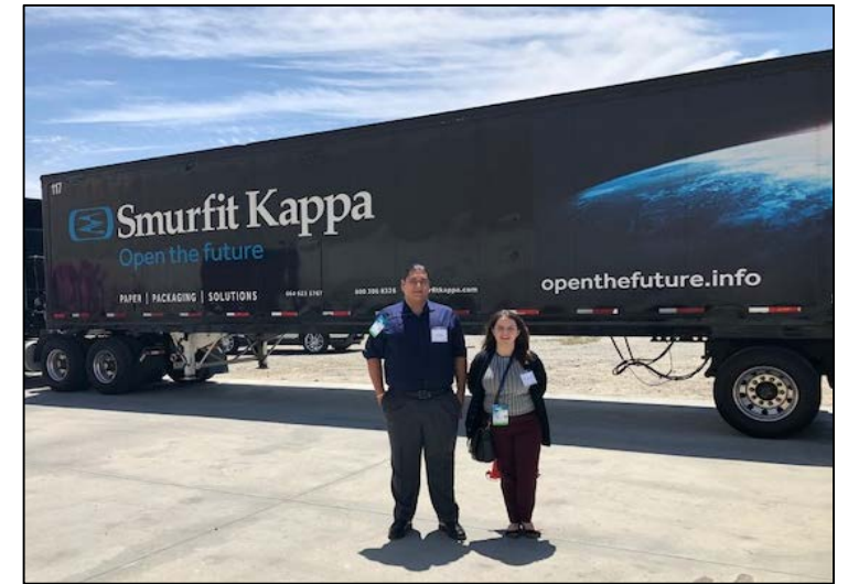
Global Trade Internship Program Global Trade