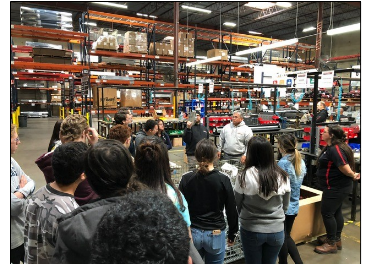
Pull Tarps / Cuyamaca College Adv. Manufacturing & Global Trade