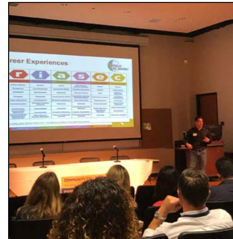
Regional Work-Based Learning Summit Miramar College All Sectors