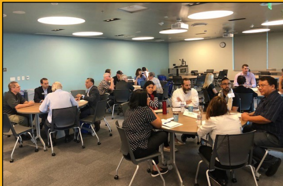
N. County Careers in Adv. Manufacturing & Global Trade Palomar College / Johnson Matthey Adv. Manufacturing & Global Trade