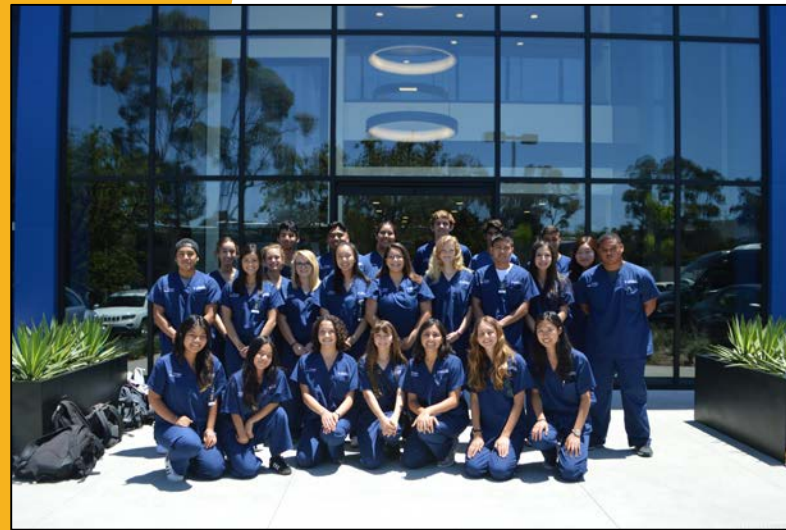
Scripps High School Exploration Internship Program Health