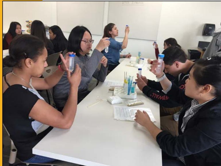
Biotech Day – Miramar College Life Sciences & Biotech