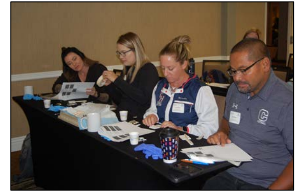
Health & Science Pipeline Initiative (HASPI) Educator Conference Health