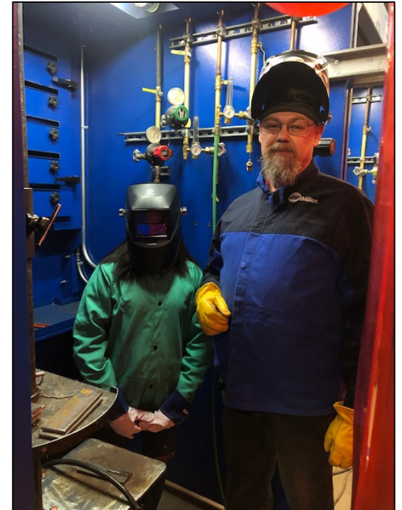
Imperial Valley College Day All Sectors