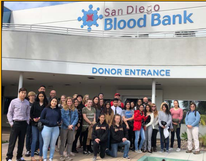
San Diego Blood Bank / Grossmont College Health