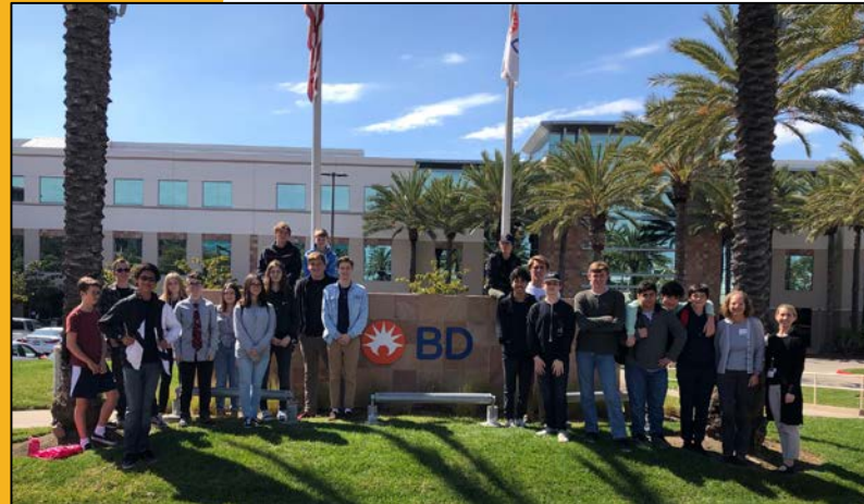
BD Biosciences / Miramar College Adv. Manufacturing & Biotech