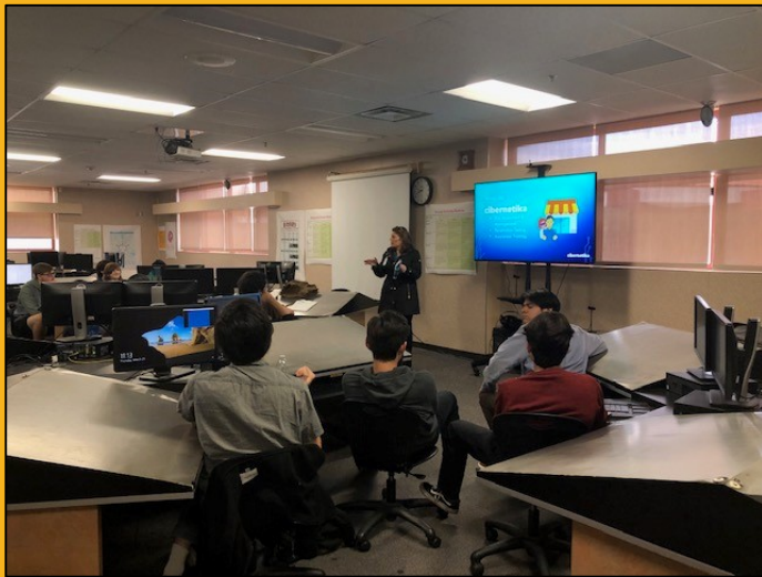
Cybersecurity Presentation ICT & Digital Media

Classroom Presentations / Internships / Mentorships