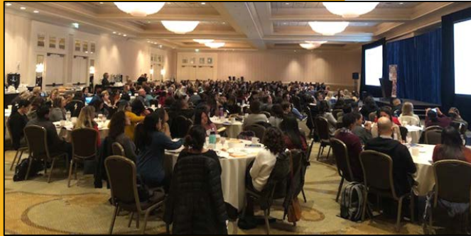
Counselor Conference All Sectors