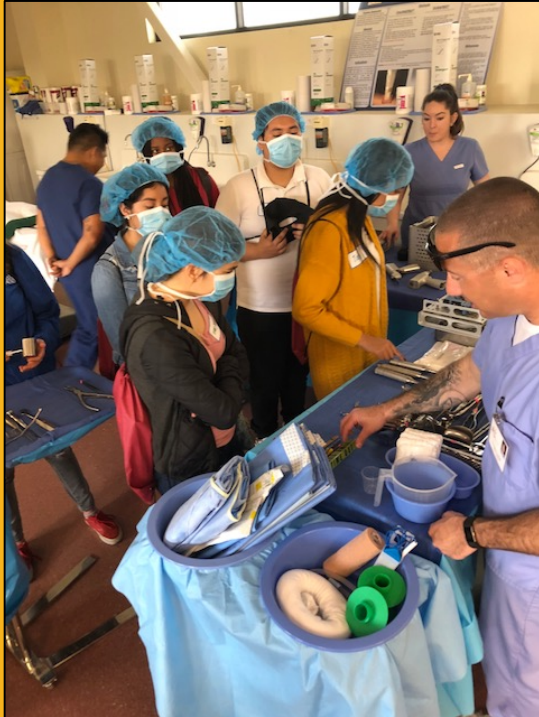
Health Career & Public Safety Exploration Day Southwestern College – HEC Otay Mesa Health