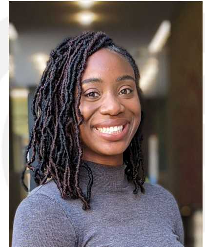
Kashae Knox Cal-PASS Plus Educational Results Partnership