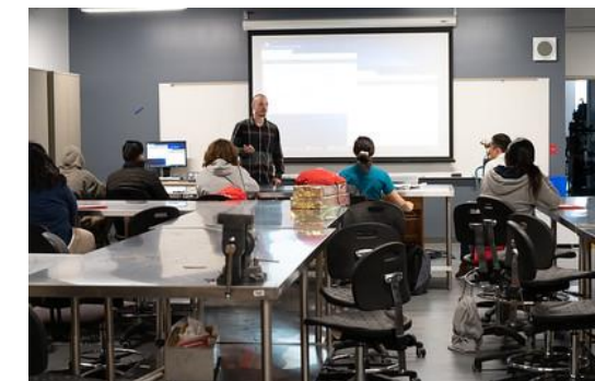
Women in Manufacturing & Engineering, San Diego City College, 2020