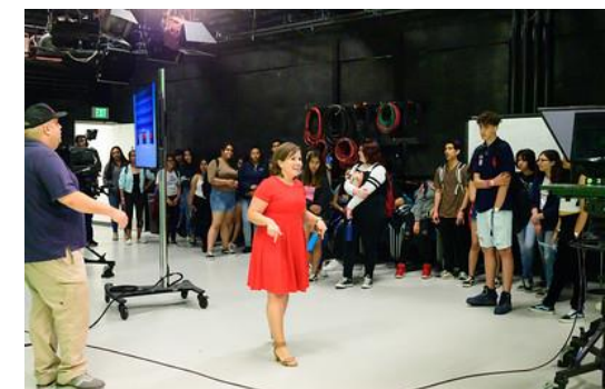
Community Open House, San Diego City College, 2019

Photographic experience | Automobiles, Models etc.