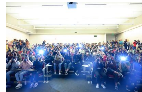
Photo 360, San Diego City College, 2020