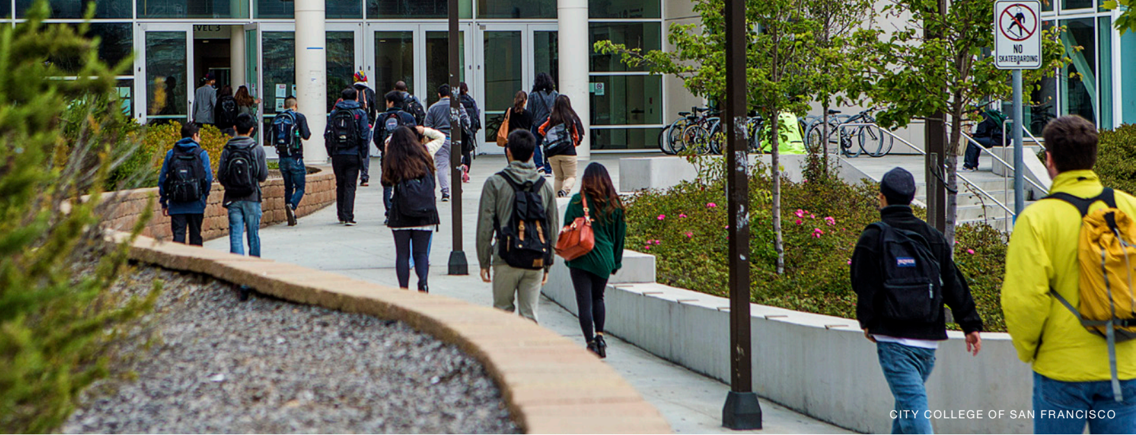
CITY COLLEGE OF SAN FRANCISCO